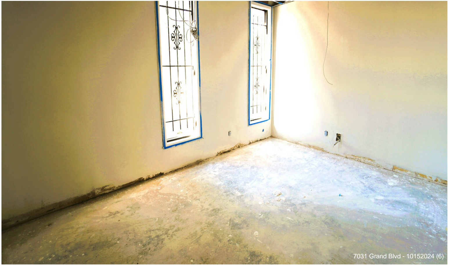
7031 Grand Blvd - 10152024 (6)