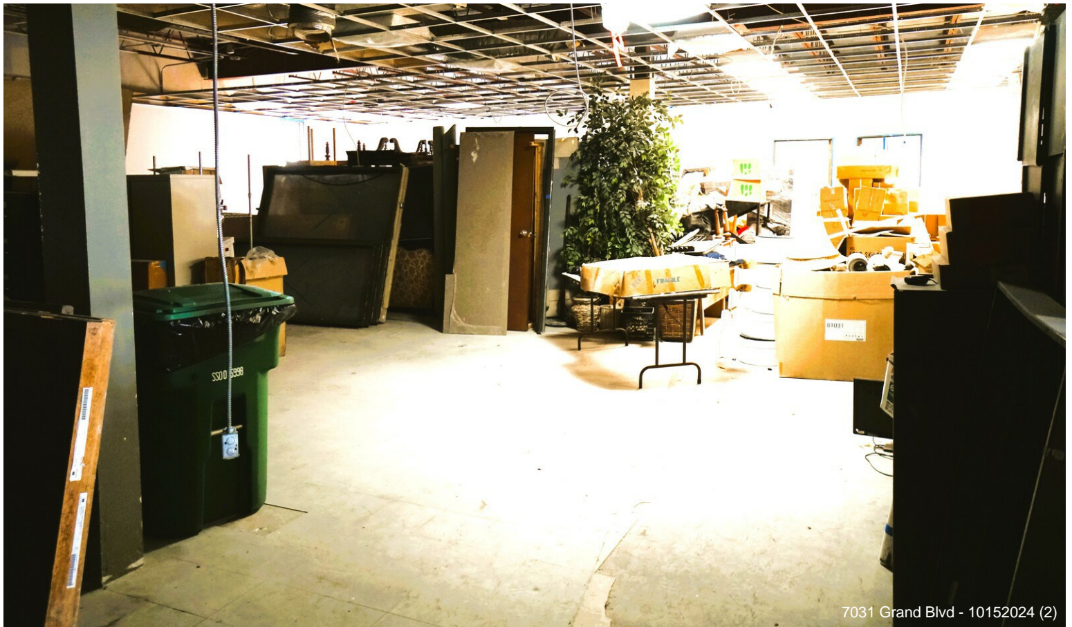
7031 Grand Blvd - 10152024 (2)