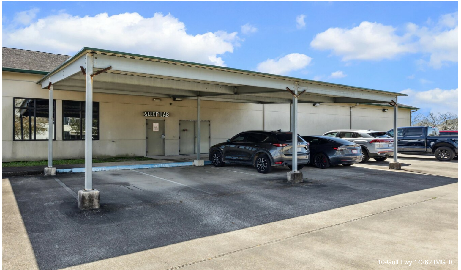
10-Gulf Fwy 14262 IMG 10