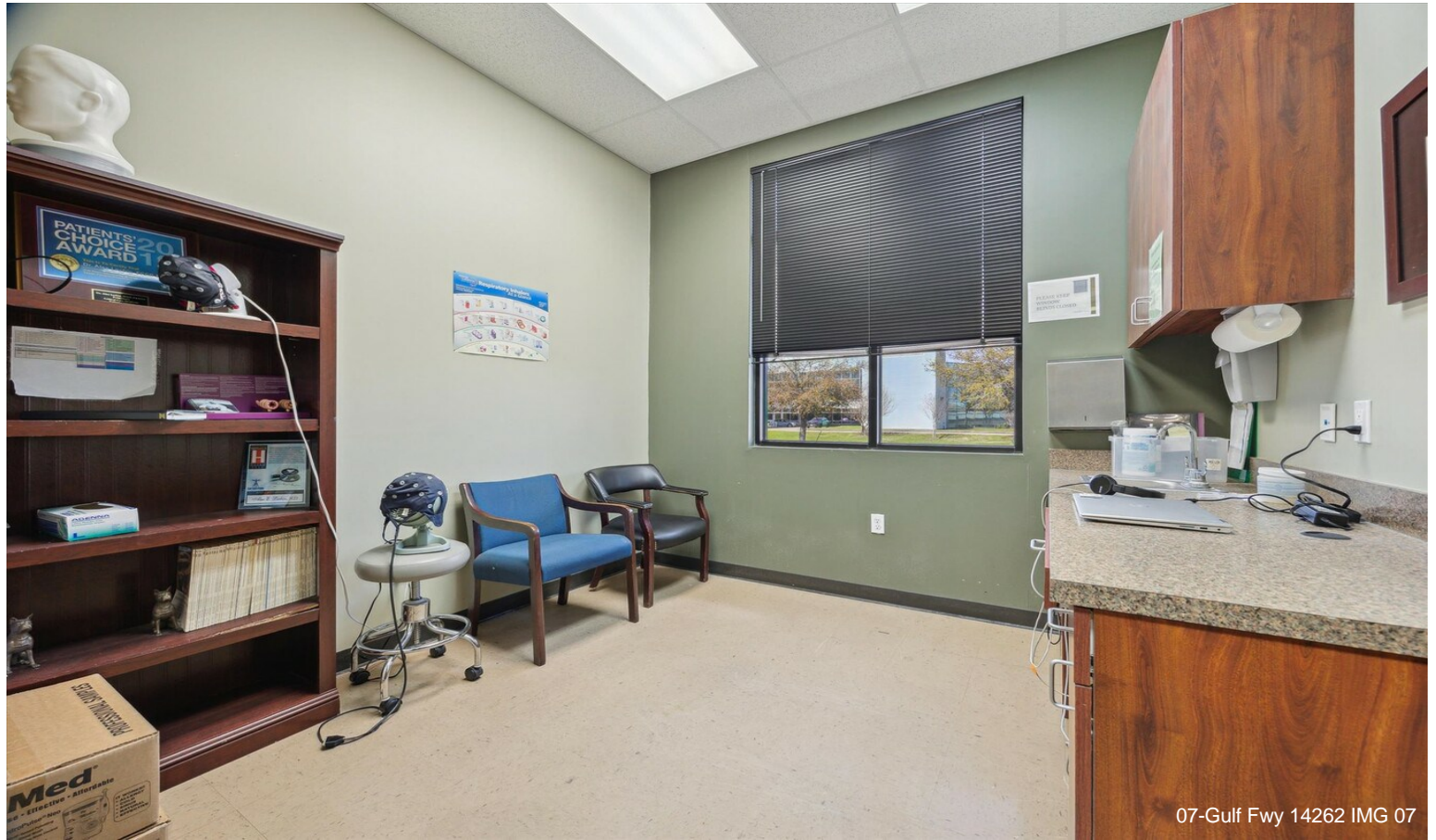
07-Gulf Fwy 14262 IMG 07