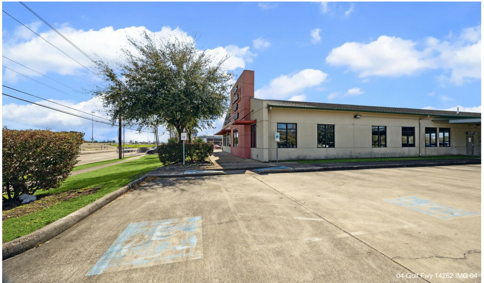
04-Gulf Fwy 14262 IMG 04